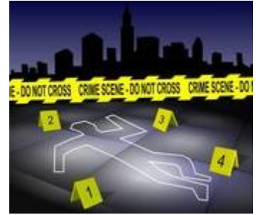
A crime scene