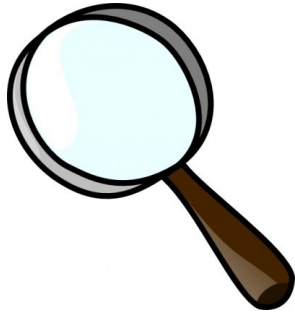
A magnifier glass